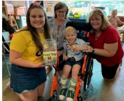
Danielle Cares for Chairs came to SCARCE in 2019 to award a wheelchair to a local child in need.

Reduce Environmental Impact, Increase Social Impact